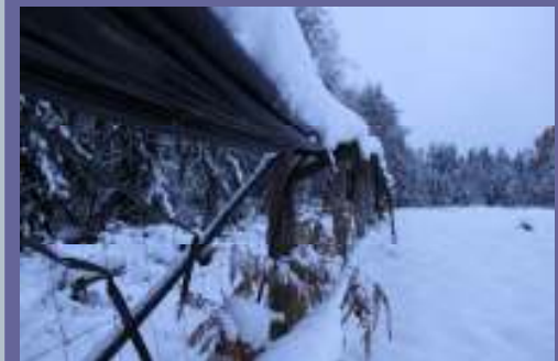
The drip lines (with a total length of more than 3 km!) are now on the new fence.