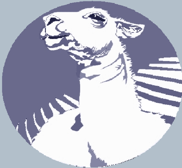
the lama's lament

Part of the THE ITA WEGMAN ASSOCIATION of British Columbia for Curative Education And Social Therapy